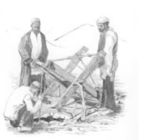
Figure 3 Muqannis Excavating Soil from a Qanat Shaft. Spoil lifted by windlass encircles the vertical shafts that link the qanat tunnel with the surface. Clearing blockage from qanat tunnels is usually required every few years. (Illustration by Ann Coffin Delano)

The time required to construct a qanat varies with the capital of the owner, the stability of ownership, underground soil and water conditions, the length of the qanat , the amount of water desired, the