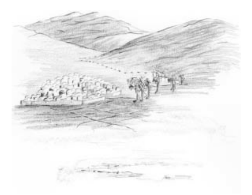
Figure 2 A Qanat-fed Alluvial Fan Village. A detailed understanding of subtle variations in topography, landscape, and subsurface water conditions is required in the siting of a qanat. Only well-known and respected muqannis are entrusted with site decisions. ( Illustration by Ann Coffin Delano )

appraised by the number of qanats constructed during their reign. For example, slaves and captives were trained to construct qanats under the Achaemenid and Sassanian kings. Maintenance and repairs were accomplished by corvée (forced labor).